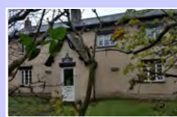
2 Three Lane Ends, Whitewell

3 bedroom farmhouse 11 acres Outbuildings Available July 2018 POA.