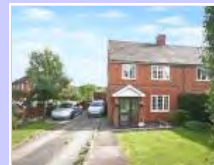
18 Pipehayes Lane - Duke of Lancaster Housing Trust

3 bedroom detached property 3 double bedrooms 2 reception rooms Large private garden POA.