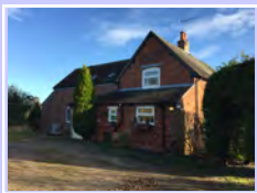
Lower Linbrook Cottage

3 bedroom detached property 3 double bedrooms 2 reception rooms Large private garden POA.