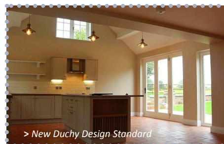
> New Duchy Design Standard

scale refurbishment projects and is being rolled out across the estates whenever possible. An annual repair and maintenance programme for rural residential properties is also ongoing to ensure that the assets are protected for future generations.