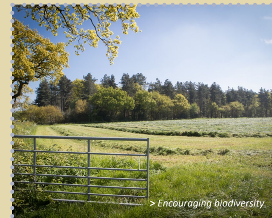
> Encouraging biodiversity

The aim of the project is to encourage, protect and preserve appropriate habitats for wild pollinators and other farm wildlife across all of the Duchy's agricultural holdings throughout the year.