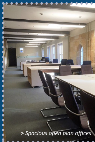
> Spacious open plan offices