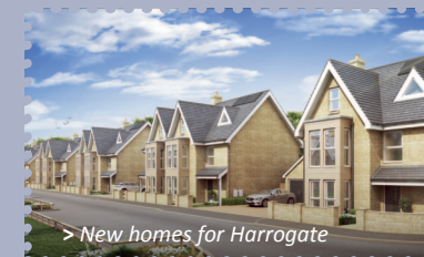
> New homes for Harrogate

The Duchy continues to work with local authorities to release land to address the national housing shortage. Strategic sites are being considered in Cheshire, Northamptonshire and Yorkshire which will potentially deliver over 3,000 new homes.