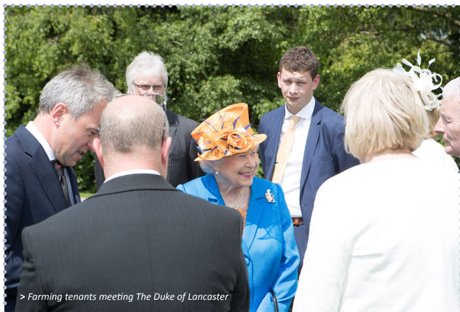
> Farming tenants meeting The Duke of Lancaster