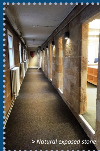
> Natural exposed stone

The Duchy of Lancaster has opened a new office at Lancaster Castle. Following a six-month refurbishment project, the former Debtors' Workshops have been sensitively restored to provide a modern office and meeting room suite capable of accommodating up to a dozen people. One of the major considerations in developing the design for the offices was the Duchy's desire to retain and celebrate the materials used in the original construction of this 19th-century block.