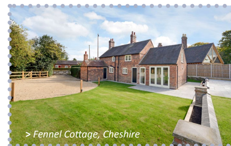
> Fennel Cottage, Cheshire

Over £2m has been spent on refurbishment projects in the year to March 2017, adding to a similar level of investment last year. More than 50 residential properties in Cheshire, Lancashire, Staffordshire and Yorkshire have now been restored and refurbished in line with the Duchy Standard, providing comfortable and contemporary living accommodation in