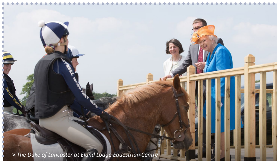
> The Duke of Lancaster at Eland Lodge Equestrian Centre