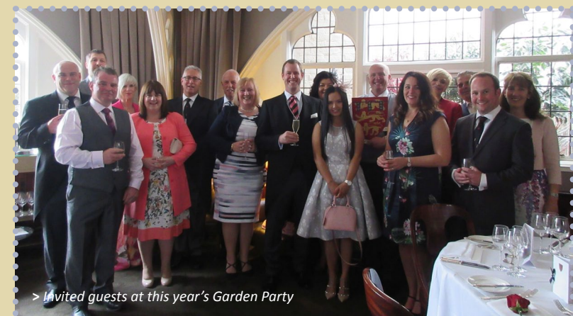
> Invited guests at this year's Garden Party

It was a wonderful day for everyone present and a rare opportunity for us to get together with those who work so hard on our behalf.