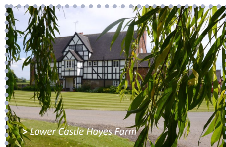
> Lower Castle Hayes Farm