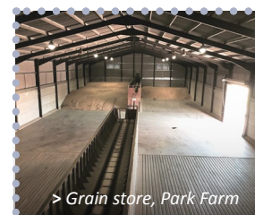
> Grain store, Park Farm