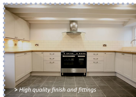
> High quality finish and fittings

historic rural settings. The response has been overwhelmingly positive with properties letting prior to completion. In fact, in many areas it has led to the establishment of a waiting list for would-be tenants who have seen the quality of the refurbishment works and are keen to move into the next Duchy Standard property that becomes available.