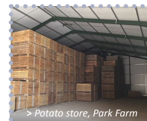
> Potato store, Park Farm