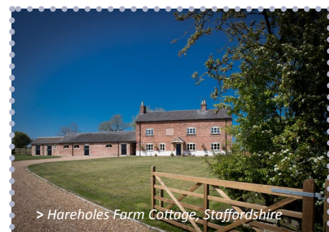
> Hareholes Farm Cottage, Staffordshire