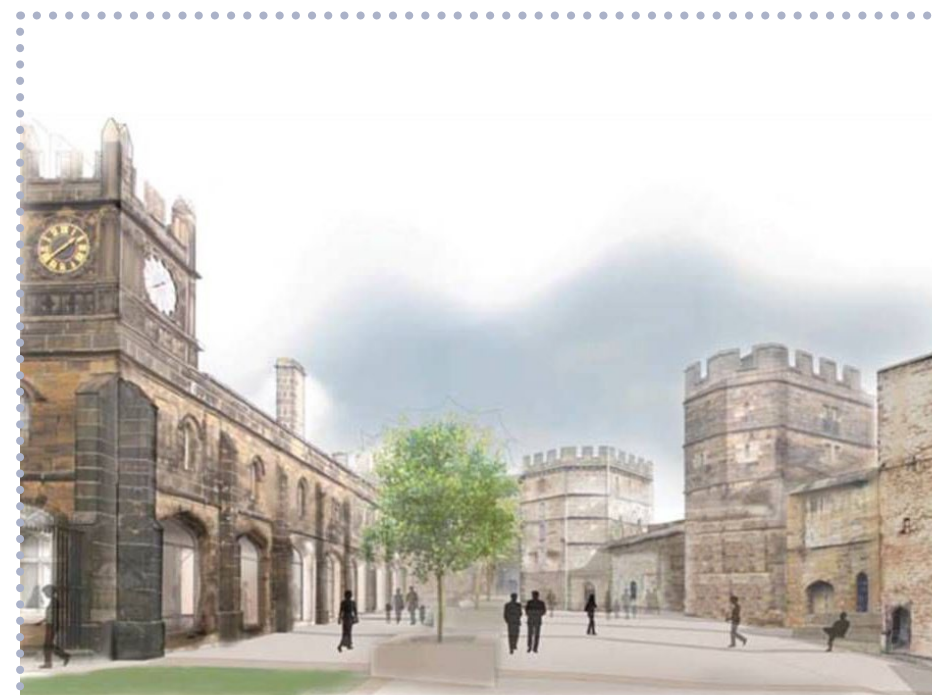
> Phase 2 underway at Lancaster Castle

The Castle will remain open throughout and will continue to run guided tours and events during the construction work. The new facilities are scheduled for completion by June 2019.