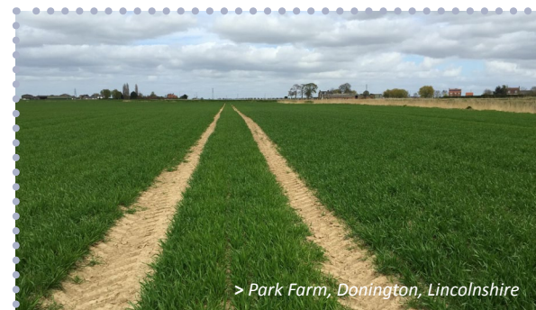
> Park Farm, Donington, Lincolnshire

The land and buildings, which include temperature controlled storage facilities for 4,000 tonnes of potatoes and 6,000 tonnes of grain, have subsequently been let to Elveden Farms Ltd. Elveden Estates is one of the country's leading fresh food producers, growing over 75,000 tonnes of potatoes, onions, parsnips and carrots per year. This is the company's first investment in Lincolnshire.