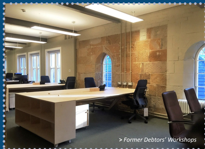
> Former Debtors' Workshops