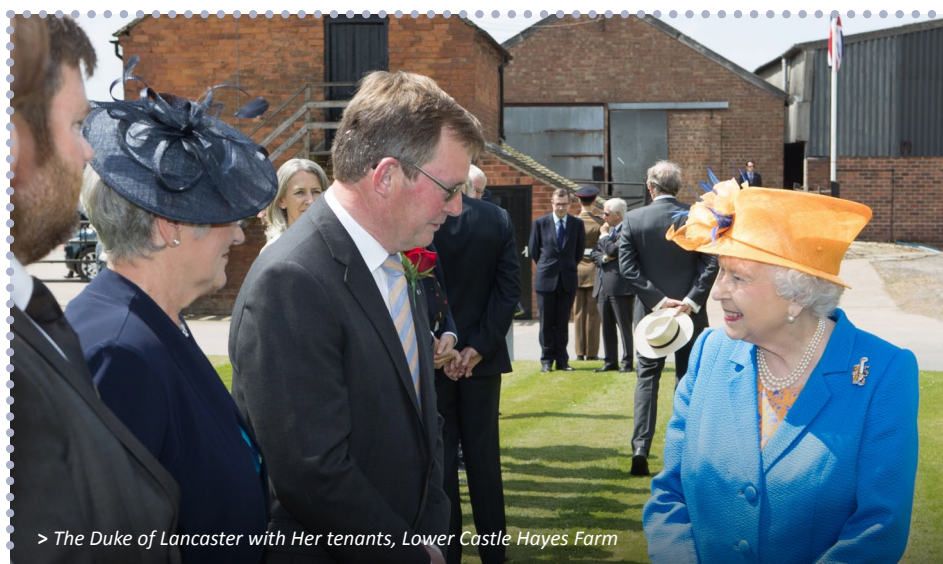
> The Duke of Lancaster with Her tenants, Lower Castle Hayes Farm