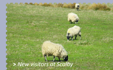
> New visitors at Scalby

Located on the cliff-top above Scarborough with spectacular views across the bay, our holiday cottages at Scalby Lodge have again been awarded a Certificate of Excellence based on positive feedback from visitors. This summer we have also welcomed a new group of residents. A flock of 30 sheep have been allowed to graze in the grounds and keep the grass neat and tidy – much to the delight of our younger guests!