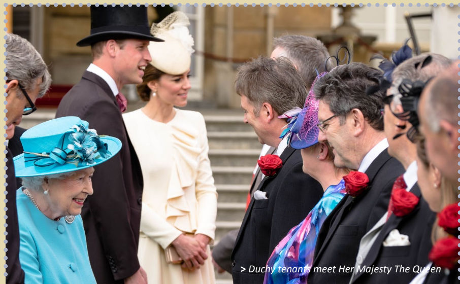
> Duchy tenants meet Her Majesty The Queen

Each year, guests from the Duchy of Lancaster are invited to one of the Garden Parties held at Buckingham Palace and attended by Her Majesty The Queen. A small number of tenants are then formally presented to the Royal Party and introduced to The Queen as Duke of Lancaster. This year, our guests included tenants from the Duchy's Southern Survey.