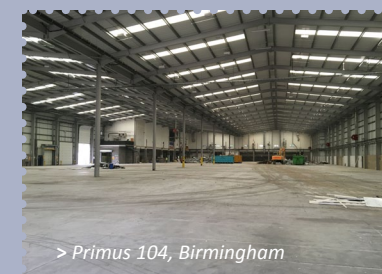
> Primus 104, Birmingham

The Duchy of Lancaster has recently refurbished a purpose-built industrial/warehouse unit in one of the country's most central locations. Primus 104 is a large, premium quality warehouse, with associated offices and a large delivery yard, located just 1.5 miles from junctions 5 and 6 of the M6 to the north of Birmingham city centre. Formerly home to British heating systems and boiler manufacturer Baxi who occupied the site since 2002, the refurbished premises has been relaunched as Primus 104. The 104,000 sq ft warehouse sits alongside other distribution and logistics centres of global brands such as Amazon, Jaguar Land Rover, Hermes, Stapletons and XPO Logistics.