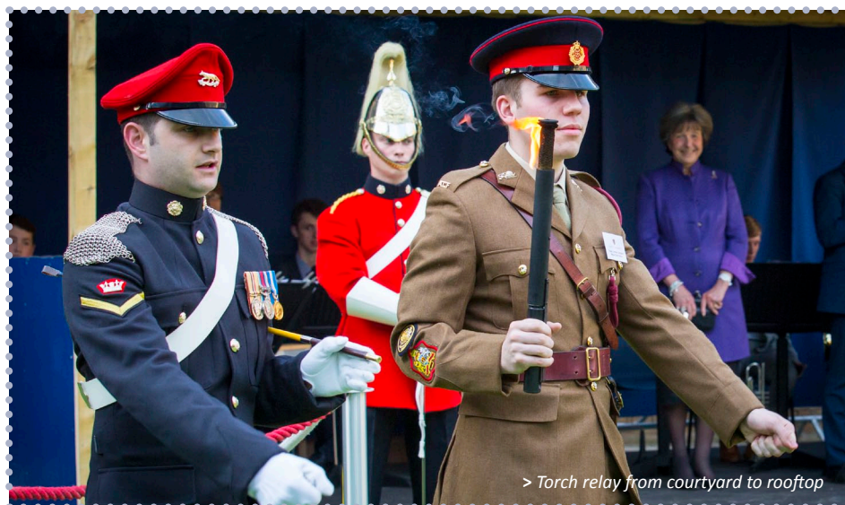
> Torch relay from courtyard to rooftop