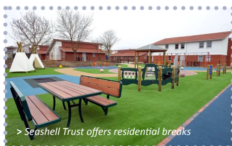
> Seashell Trust offers residential breaks

In the North West, the Benevolent Fund is supporting the valuable work of the Seashell Trust and its bursary scheme for residential short breaks. Designed for families in crisis, the Trust is the first charity in the UK to offer this type of respite care. The scheme will provide short breaks for the families of profoundly disabled children and young people aged between 3 and 25 years.