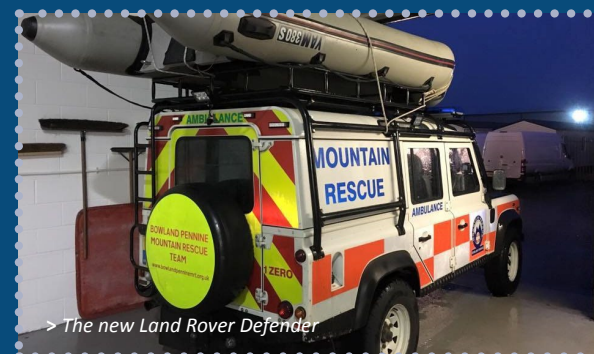
> The new Land Rover Defender

With the support of the Duchy of Lancaster Benevolent Fund, the Bowland Pennine Mountain Rescue Team has been able to