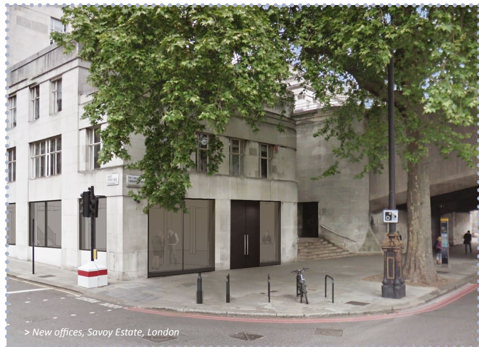
> New offices, Savoy Estate, London

The Duchy has appointed award-winning architectural firm Morrow+Lorraine to redesign one of its prestige office suites on the ground floor of 9 Savoy Street, London. This will include the creation of a new, self-contained entrance onto the Embankment and the remodelling of the interior floorplate to transform it into a fully refurbished open plan space.