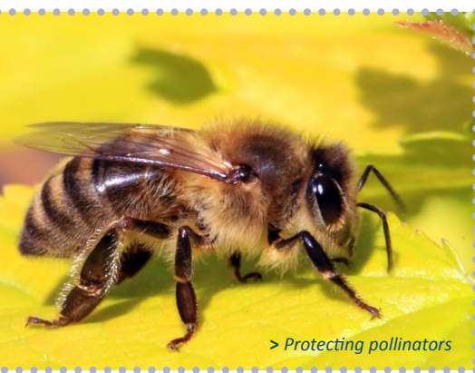
> Protecting pollinators

We recognise that our farming tenants have good local knowledge of the Duchy land which they farm and we hope therefore that they will take an active role in this initiative to help ensure that a sound ecological balance is maintained at all times.