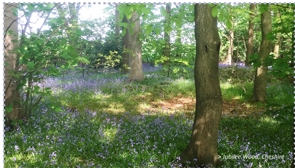
> Jubilee Wood, Cheshire

The Duchy of Lancaster has commissioned a bio-diversity audit across all of its rural holdings in England and Wales. Working in partnership with Natural England and the Game and Wildlife Conservation Trust, the audit will take two years to complete and will culminate in an action plan for protection and conservation to be implemented in 2019. The Duchy's rural estates include an extraordinary breadth of habitats, including woodland, water courses, grassland, arable farmland, hedgerows, field margins, moorland, foreshore and more formal landscapes.