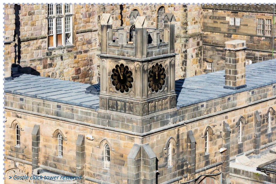
> Castle clock tower restored