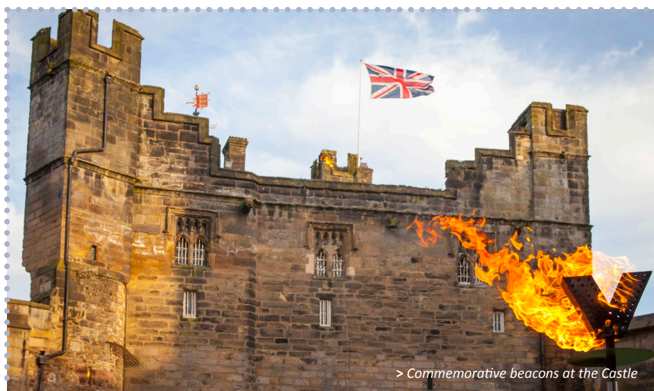
> Commemorative beacons at the Castle

While the country celebrated the 90th birthday of Her Majesty the Queen earlier this year, the Duchy of Lancaster had cause for a double celebration. The Queen is now the longest serving Duke of Lancaster in the Duchy's 750-year history. A commemorative beacon-lighting ceremony was held at Lancaster Castle to mark the occasion,