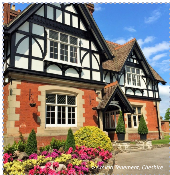
> Amicia Tenement, Cheshire

After a comprehensive programme of refurbishment works to bring this period property up to the new Duchy Design Standard, the team was able to unveil the finished product to the general public. Set in three and a half acres of garden and parkland with a commanding view over open countryside, its magnificent façade is now matched by the quality of the interior finish, creating a home that is designed for modern family life and a new chapter in its long and illustrious history.