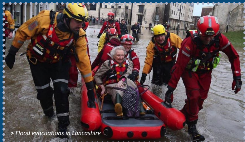
> Flood evacuations in Lancashire

vehicle is registered as an ambulance and can be reconfigured to carry a casualty over rough terrain.