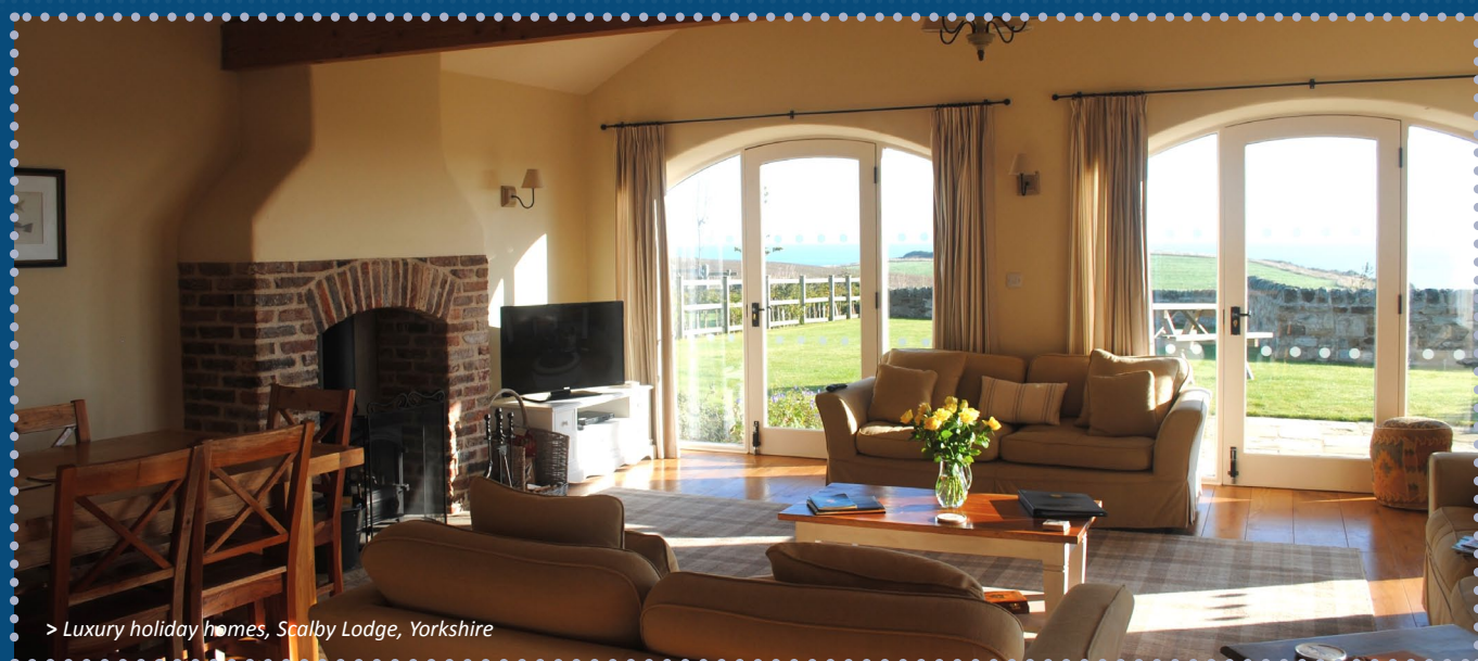
> Luxury holiday homes, Scalby Lodge, Yorkshire

'We all make mistakes, but don't make the same one twice'. This was given to me when I was a young graduate after I made a very costly mistake on a construction project. The person who gave me the advice was the one who had to clear up the mess I had made, so I never forgot it!