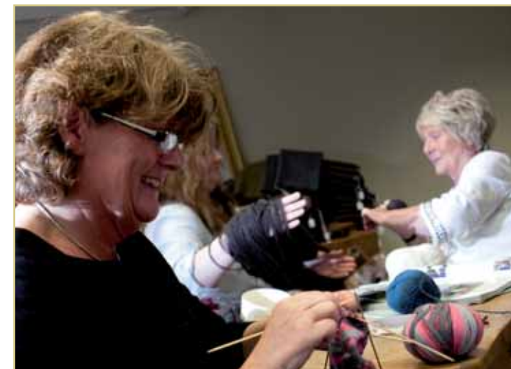
Knitting with Quilting Mellons

layout and spectacular views on offer. Root Hill Estate Yard is an award-winning development which offers a small number of individually designed office suites, ranging in size from 400 to 1,730 sq ft. Designed to provide much-needed office accommodation for small and growing local businesses, it is a working environment which is as attractive and inspiring inside as its setting is spectacular on the outside. For further information or details of the flexible terms available to local businesses, please contact the Smiths Gore team on 01772 663120.