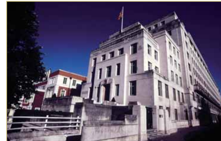
The Duchy office, Lancaster Place

Thank you to those who attended this year's Tenants Forum at the Great Yorkshire Show in Harrogate. I hope you found it an informative session