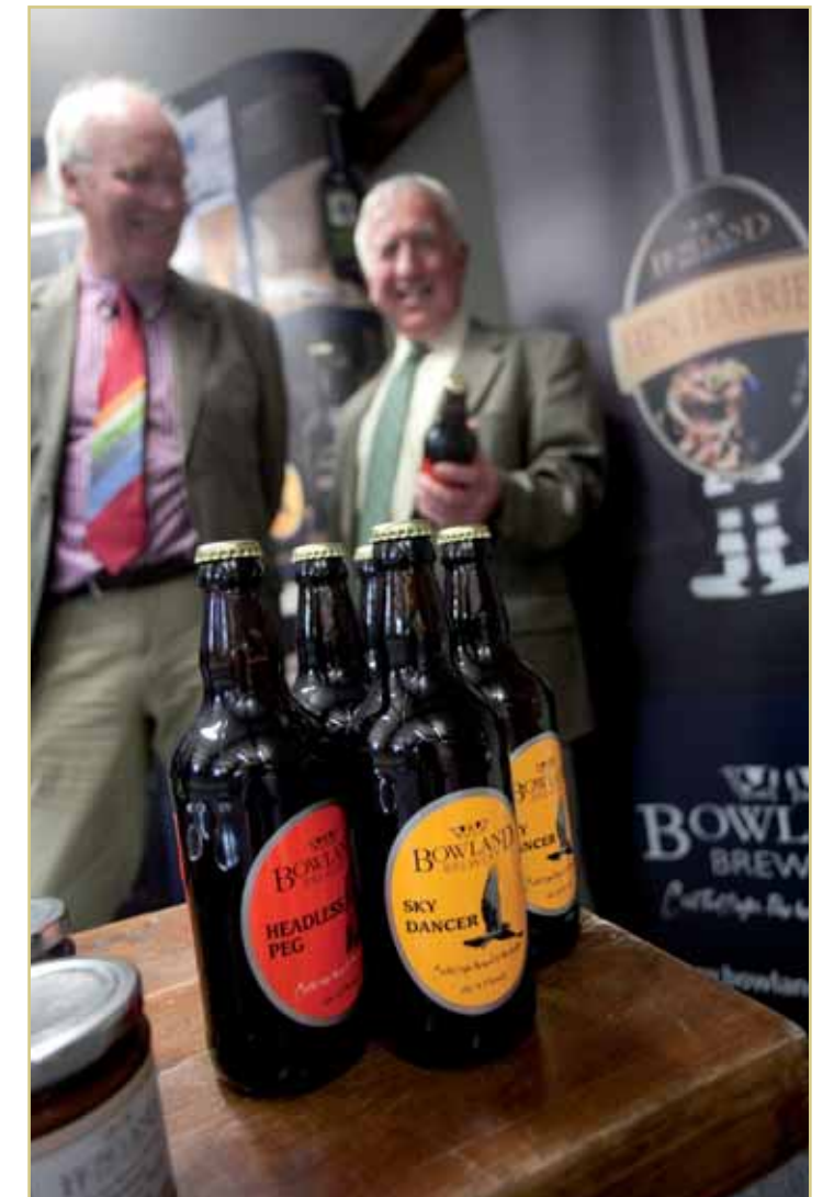
Bowland Brewery sampling